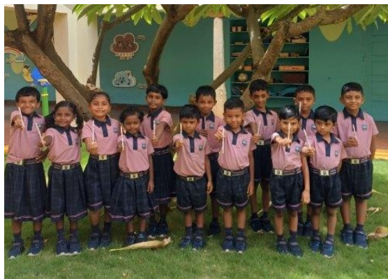
UKG - C