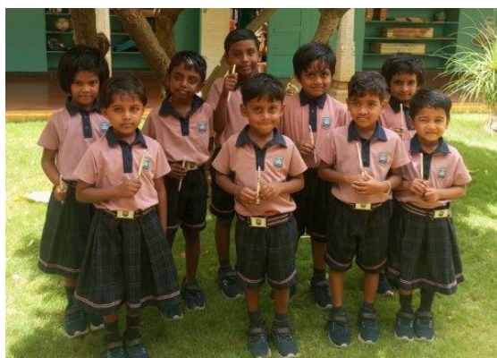
UKG - D