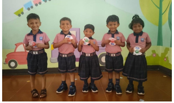
PRE KG - A