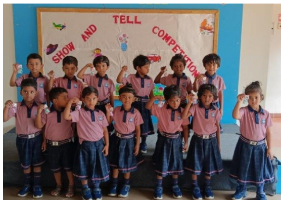
LKG - D