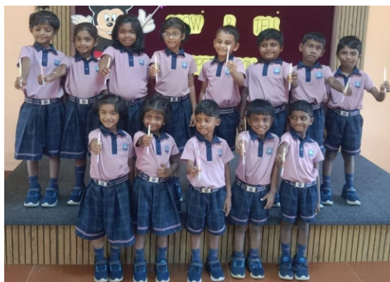
UKG - A