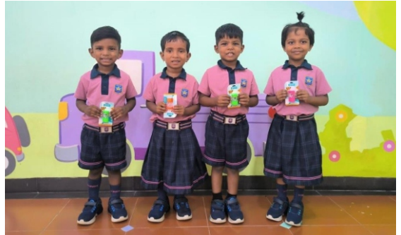
PRE KG - B