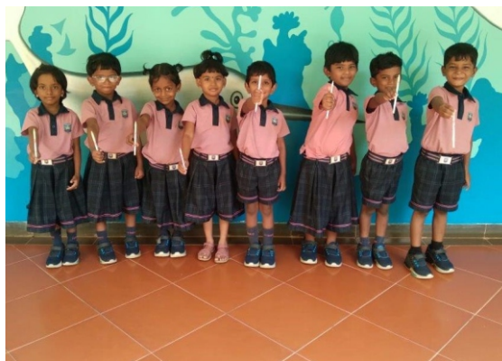
UKG - B