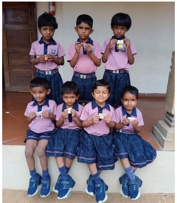
LKG - C