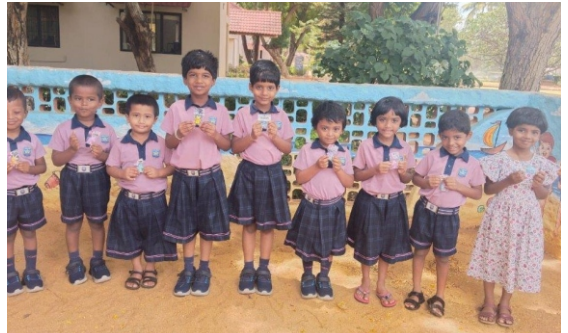
LKG - A