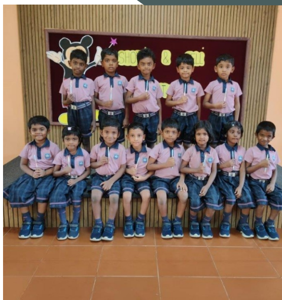
UKG - E

Here are a few gentle tips to make the break enjoyable: