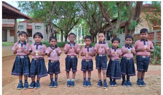
LKG - B