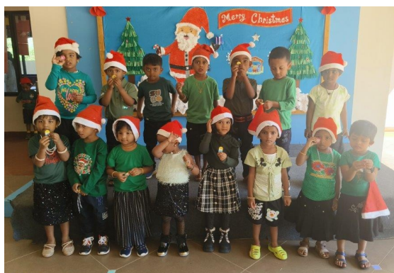
PRE KG - A