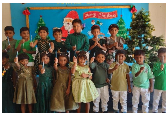
LKG - B