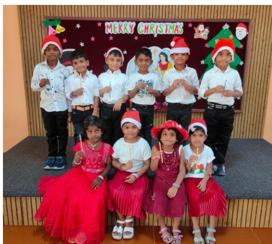
UKG - E