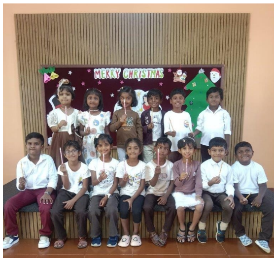
UKG - A