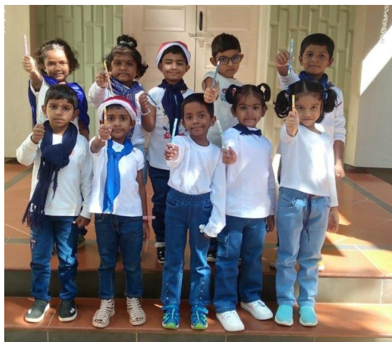
UKG - B