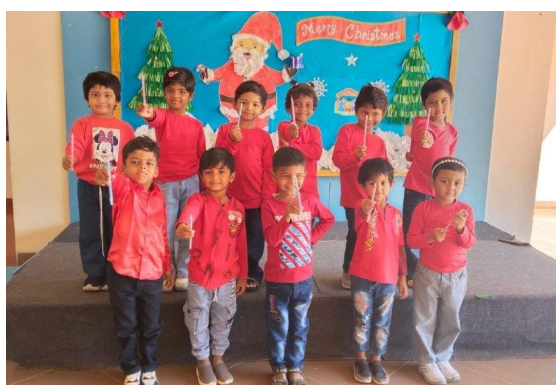
LKG - A