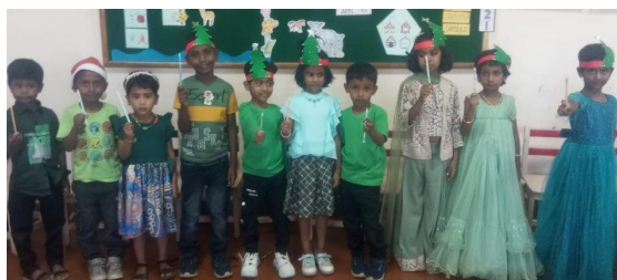
UKG - D