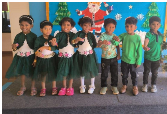
PRE KG - B