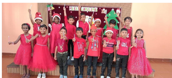
UKG - C