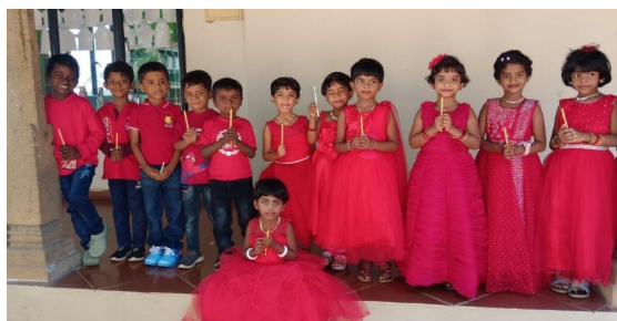
LKG - D