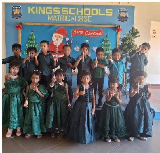
LKG - C